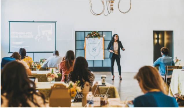
Note: Presentations can be personalized to fit your audience's culture and needs.